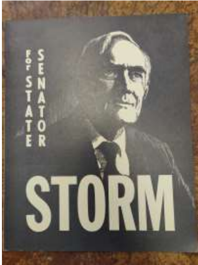
Far Left: 1950 Campaign Photo